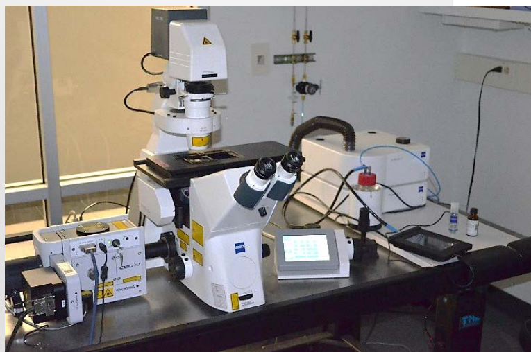
Zeiss Spinning Disk Confocal Microscope