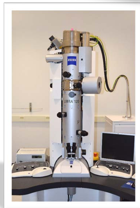
Zeiss LIBRA 120 TEM

For more info or to join the Nanomanufacturing Innovation Consortium (NIC), please contact-