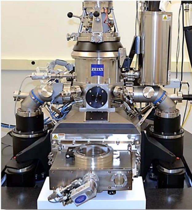
Zeiss ORION Helium Ion Microscope